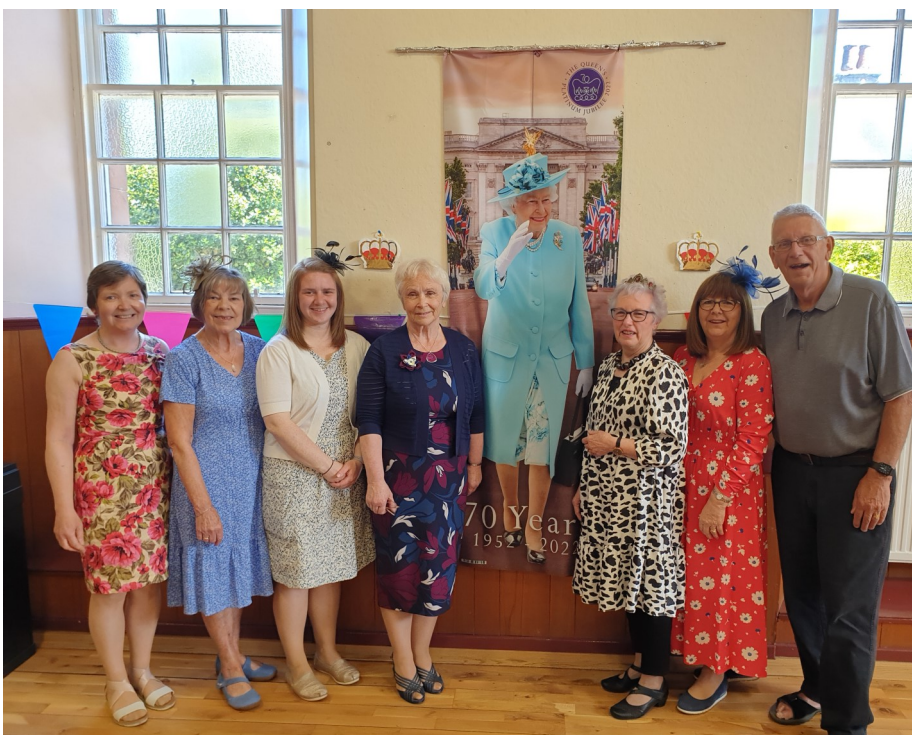
Members of the Mission, Outreach and Fellowship (MOF) Committee