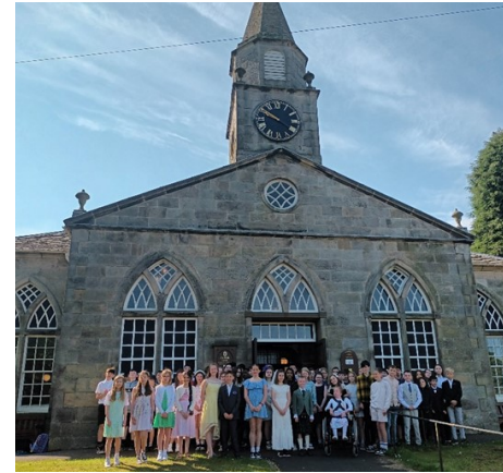
P7 returning to the Kirk for a wedding! Same bride and groom as P1!

3pm Service of Thanksgiving and Communion especially for those who find it difficult to get to the morning service.