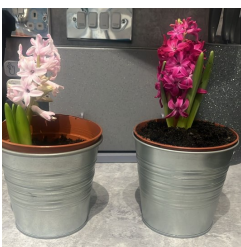
Some beautiful hyacinths the boys managed to grow.