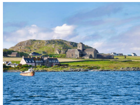
The Abbey with Bishop's House