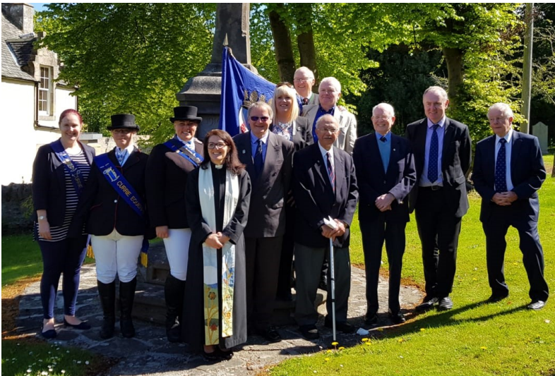
Kirkin of the Community Council took place in Currie Kirk on Sunday 12 May